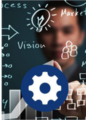
OUTSTANDING CUSTOMER EXPERIENCE