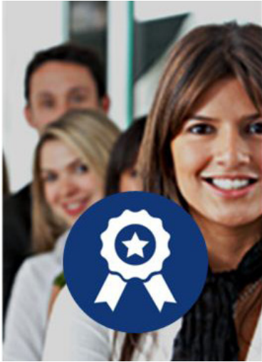
DIFFERENTIATE TO STAND OUT