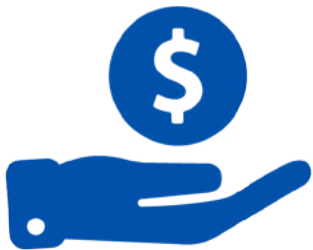
Cost per call