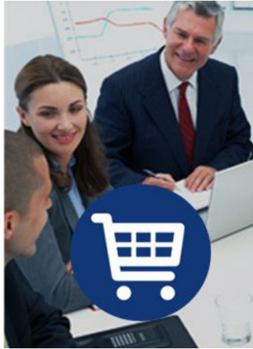
MODERNISE SALES & MARKETING