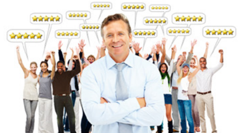
Improving the customer experience